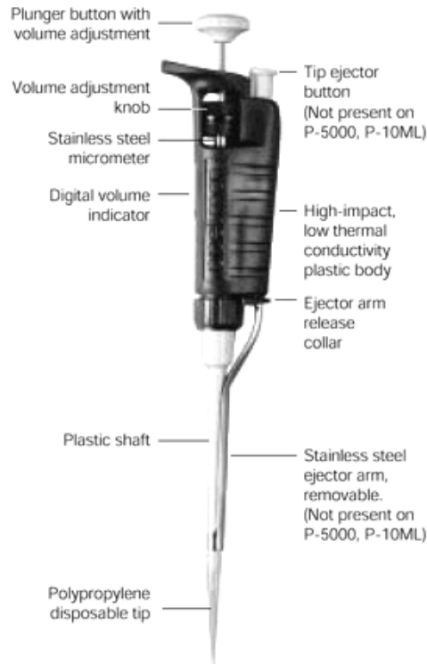
Fig. 1 Rainin Pipetman

contamination in PCR, and thus can cause problems. You may have some experience with pipettes, but a refresher on pipetting is probably quite useful.