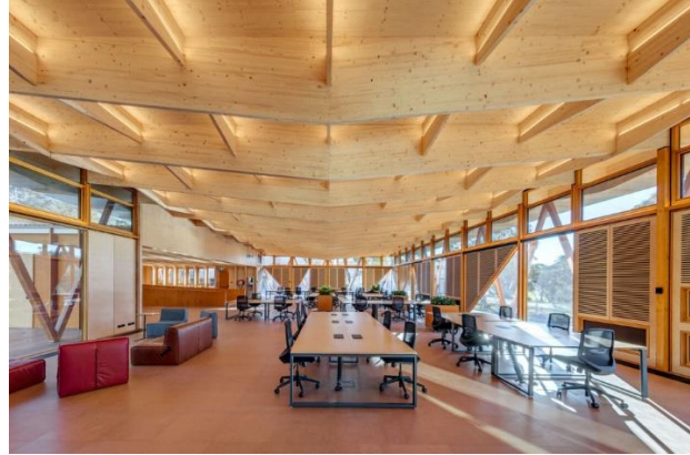
Macquarie University Innovation Hub

Business in the United States is pivoting to acknowledge itself as an ecological driver to respond to and take advantage of major legislative changes such as the Inflation Reduction Act (I.R.A.) enacted 50 years after the initial establishment of the EPA. Rapidly improving technological tools proliferate just as consumer markets, increasingly skeptical of “green washing,” are demanding safe, effective and sustainable goods and services. The federal government is currently supporting CE innovations and is offering significant funding over the next 9 or so years to help transform the national economy to a circular one. The architecture, engineering, construction, building operation industry accounts for more than 40% of all global material use and generates over 35% of waste. One way for architects to understand and accurately shape an effective climate crisis response is to use emerging tools and techniques to visualize, quantify, and compare design alternatives. Guided by the judicious application of various sustainable design framework methods we can simulate and reduce each project’s environmental impact. In this course you will practice with both the CE framework and BIM plug-in tools applied to an existing project