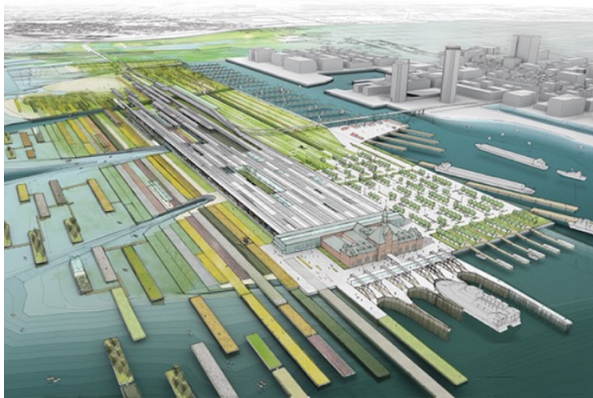
Lewis Tsurumaki Lewis, Water Proving Ground

Course Hours: Tuesday | Thursday 10:00 – 11:20 am Location: FMH 309