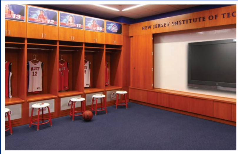
Women's basketball locker room at Estelle and Zoom Fleisher Athletic Center