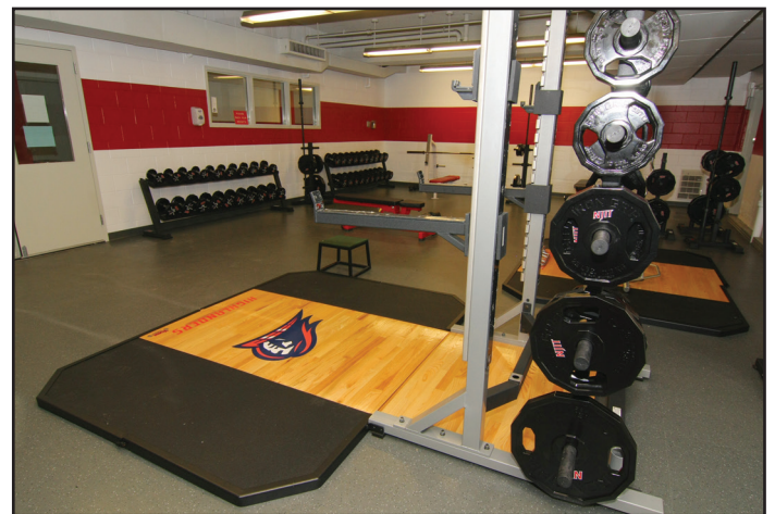
NJIT Athletics Weight Room at Estelle and Zoom Fleisher Athletic Center

The NJIT men's and women's indoor track & field team trains at the Jersey City Armory which is home to a 6-lane indoor 200m track while the outdoor track & field team trains at the Nat Turner Park 6-lane outdoor 400m track.