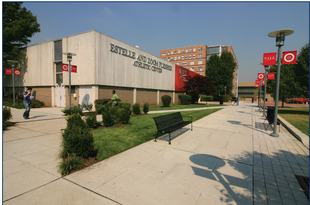
The Estelle and Zoom Fleisher Athletic Center

In the fall of 2005, when the Northeast was hit with record rainfall, games went on without a hitch at Lubetkin Field, thanks to the quality of the surface. Indeed, with the rain disrupting schedules around the region, some crucial Big East contests involving Seton Hall were moved to NJIT's home field. Those games, too, went off without a hitch.