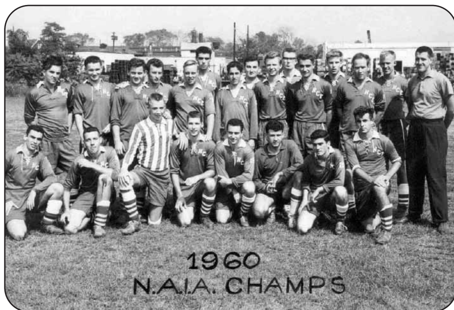
THE 1960 NCE NATIONAL CHAMPION SOCCER TEAM.